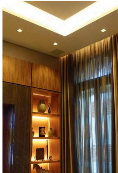
THE LIGHTING: For 15 years, lighting LEDs products have evolved well giving us multiple solutions obtained thanks to home automation. It is important to consider before buying the type of lighting desired and the custom atmospheres to create.