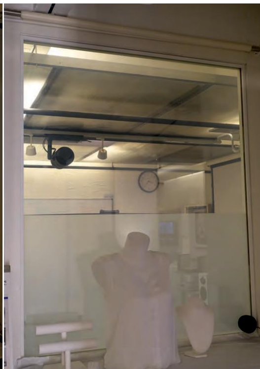
Concept ART: Transparent and Opaque Curtain