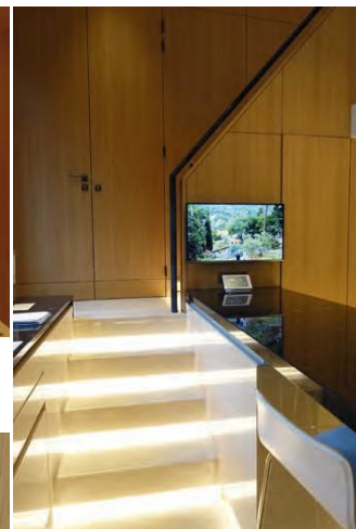
Kitchen Lighting Tv 7" Touch