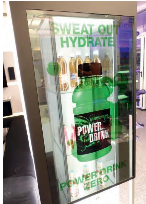
Transparent screen - Dynamic display showcase - digital marketing