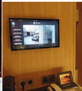
Kitchen Security cctv - 20" Touch screen