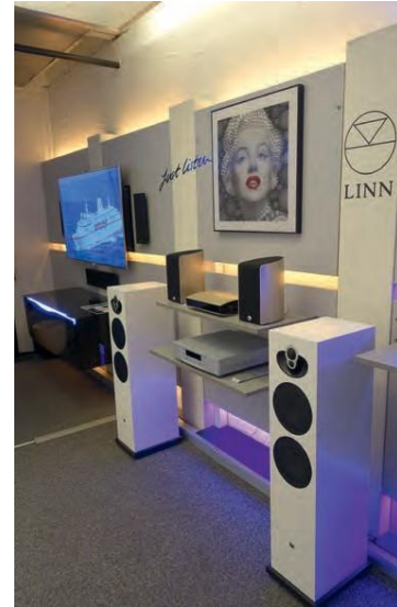
LJNN: TAD Integration represents this iconic brand Scottish high-end Hi-Fi equipment, which gives the advantages to read audio content not compressed and intuitive use from a developed interface by LINN compatible with tablets and smartphones