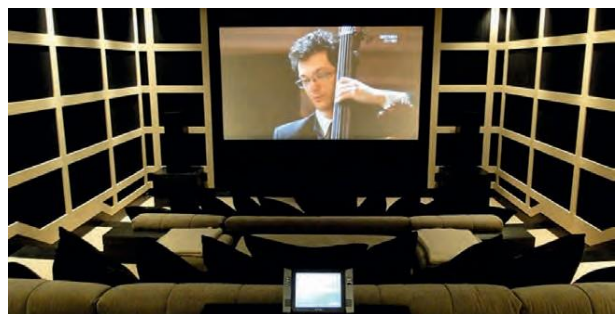
PRIVATE CINEMA IN GENEVA