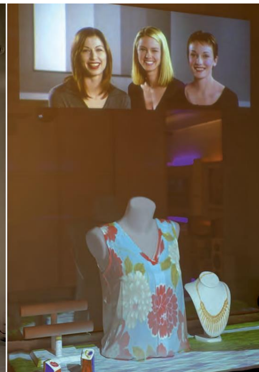
Concept ART and Mapping Video