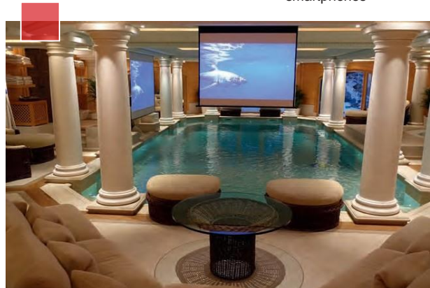
CHALET COURCHEVEL 1850