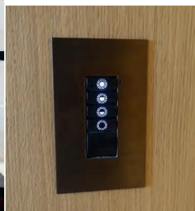
Cameo Keypad Crestron engraved with