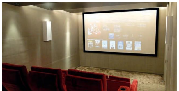
PRIVATE CINEMA – PARC MONCEAU PARIS