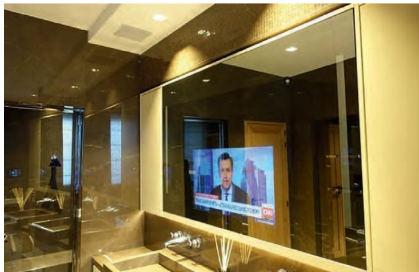
TAD Integration creates limitless experiences in the integration of design technologies, especially in the transparency aspect

Trusting TAD Integration means ensuring a quality, efficient and design installation as well as personalized follow-up and expert advice.